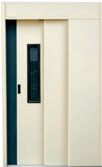
MANUAL TELESCOPIC DOORS