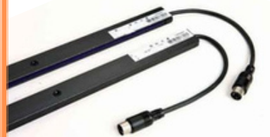
LIGHT BEAM SENSOR