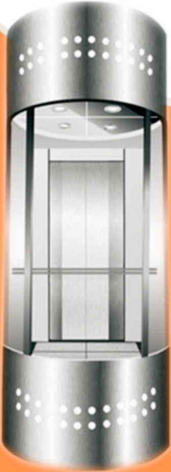
CAPSULE CABIN (M.S. & S.S.)