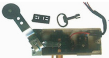
SWING DOOR LOCK