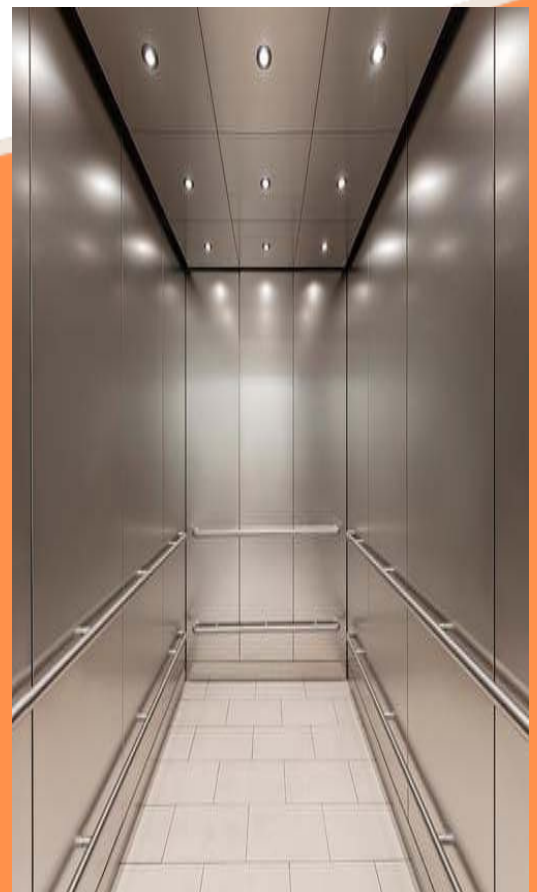
STRUCTURE CABIN (M.S. & S.S.)