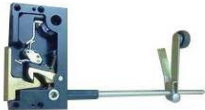
OTIS TYPE GATE LOCK