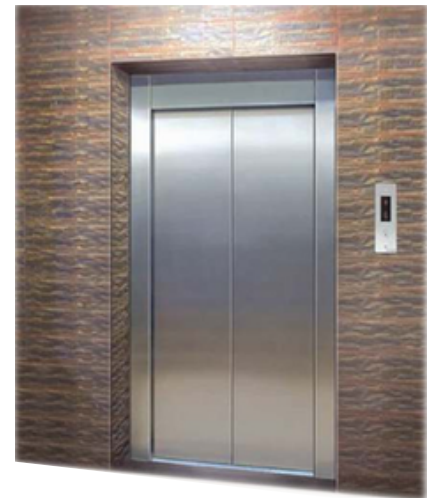
S.S. AUTO DOORS