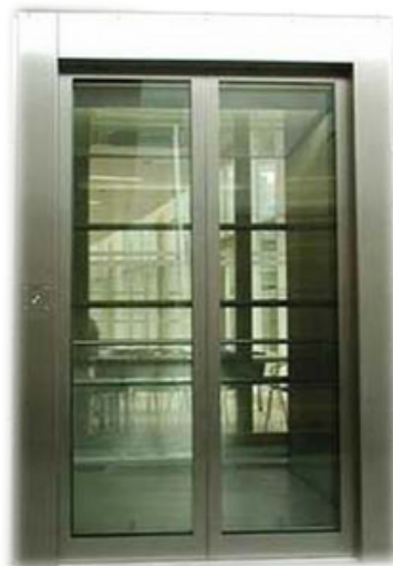
GLASS AUTO DOORS