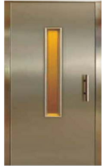
M.S. SWING DOORS